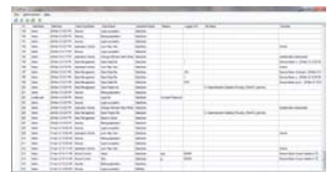
DatPass Audit Trail

DatPass is a user administration software, which supports the assignment of passwords and operating privileges for all fourtec industry application software including DataSuite, ensuring CFR compliancy. CFR is a Food and Drug Administration (FDA) issued regulation (Title 21 Code of Federal Regulations, Part 11).